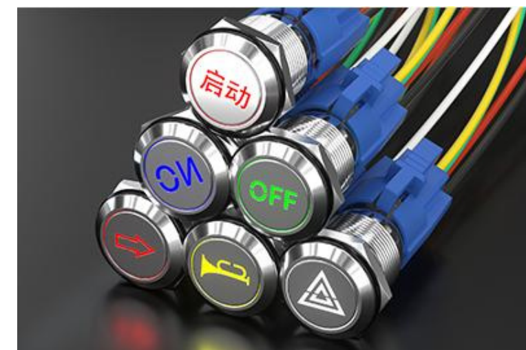
Custom laser symbol head