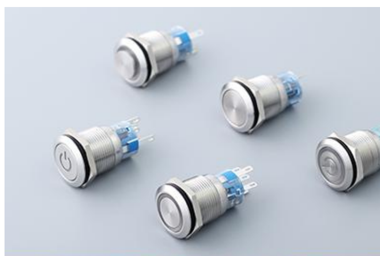
Multiple types of push button switches

Our waterproof push button switches products have updated the technology that can use the matching connector to realize the faster and easier connection of your device in the circuit connection process. At the same time, we can support the characteristics of customized head symbols, electroplated oxidation color shell, and multi-color lamp beads, which can better adapt to more scenes.