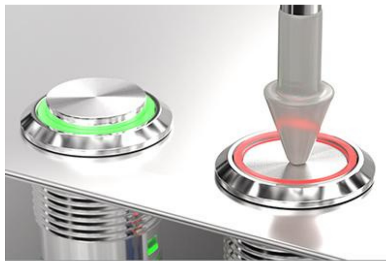
Bi-color color, Tri-color lamp bead