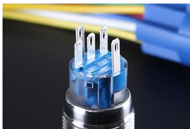
Brass silver-plated terminal