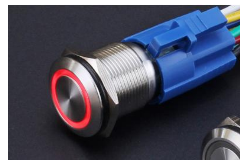
Button matching connector