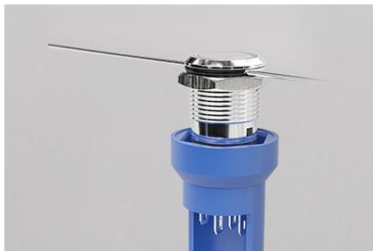
Suitable mounting handle